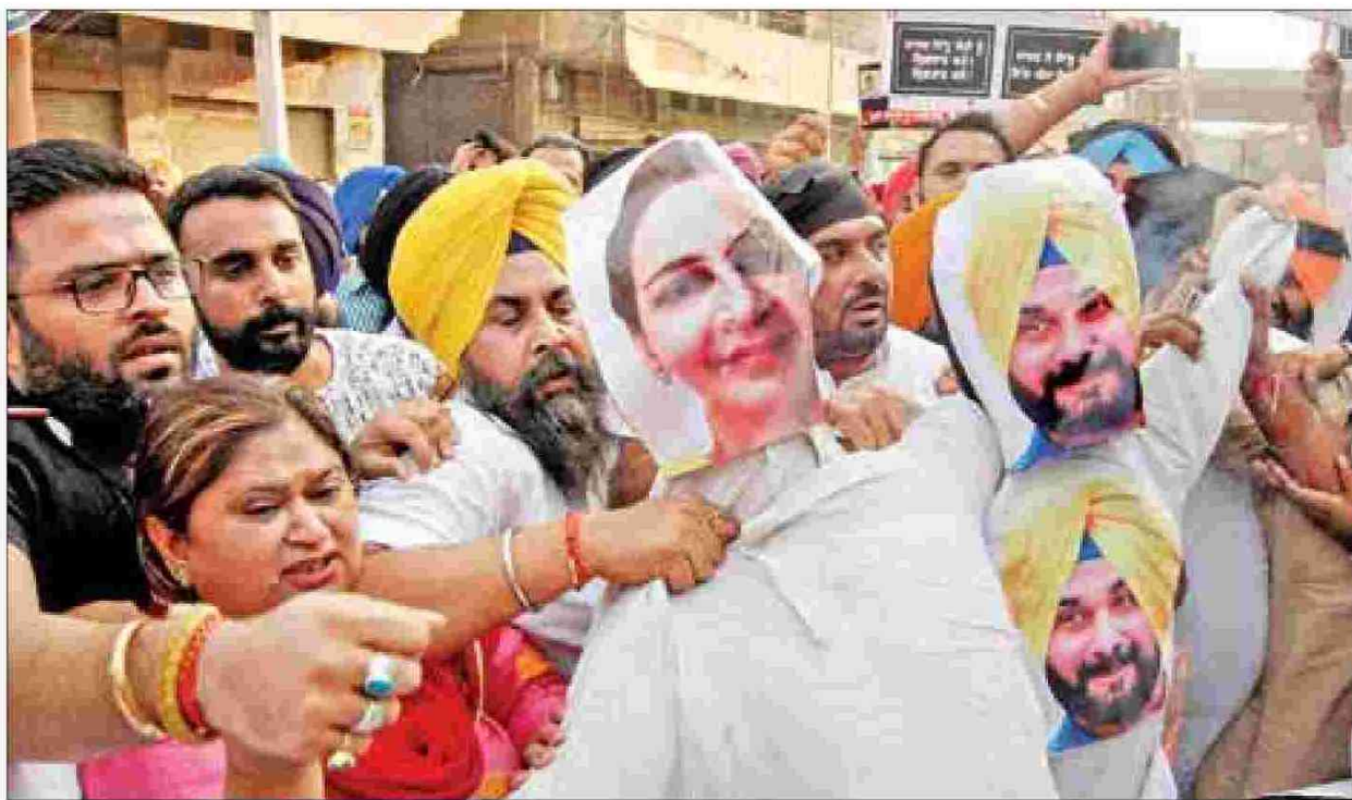
BJP-SAD leaders carry the effigies of Navjot Sidhu and his wife Navjot Kaur during a protest against the state government over the Joda Phatak mishap, in Amritsar on Monday

Activist tells Bihar court organisers of the event are responsible for deaths