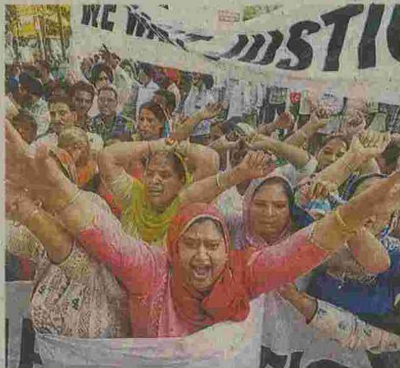
जोड़ा फाटक रेल हादसे को लेकर शिरोमणि अकाली दल व भाजपा ककी तरफ से सिद्धू दंपती के खिलाफ किए गए प्रदर्शन के दौरान नारेबाजी करती महिला कार्यकर्ता

दूसरी तरफ खैहरा ने बयान जारी कर कहा है कि उनके बयानों को तोड़-मरोड़ कर पेश किया जा रहा है। उनके कहने का संदर्भ था कि इससे छोटे हादसे पंजाब और देश में रोजाना हो रहे हैं, जिसकी तरफ सरकार का ध्यान नहीं है।