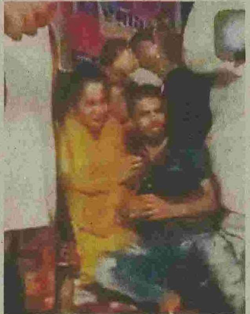
अमृतसर में दशहरा कमेटी ईस्ट की तरफ से जोड़ा फाटक पर आयोजित दशहरा मेला के मौके पर मंच पर उपस्थित पंजाब के निकाय मंत्री नवजोत सिंह सिद्धू की पत्नी नवजोत कौर सिद्धू के साथ सेल्फी लेते समर्थकों की वायरल तस्वीर • (वायरल वीडियो से)