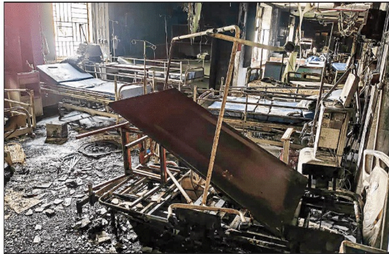
The charred equipment and beds at a trauma centre of SCB Medical College and Hospital after the fire incident in Cuttack on Monday

Seven of 23 patients across two ICUs died in their beds while three succumbed to their injuries while being moved to a portion of the hospital untouched by flames. A 45-year-old man and an 11-year-old girl died later in the