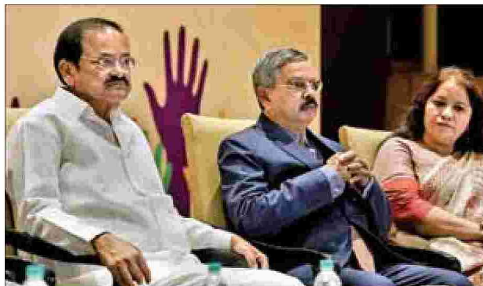
VP M Venkaiah Naidu and NHRC Chief Justice HL Dattu (C) during the silver jubilee celebration at NHRC, in New Delhi on Monday

"It is time for the global community and the UN to come together at the earliest and take united action against terror. This is the need of the hour. We have terror here; on one hand, one of our neighbours is aiding, abetting, funding and training terrorists and on the other hand, talking about peace. Terror and talks cannot go together," said Naidu. He was speaking at the silver jubilee celebrations of the National Human Rights Commission.