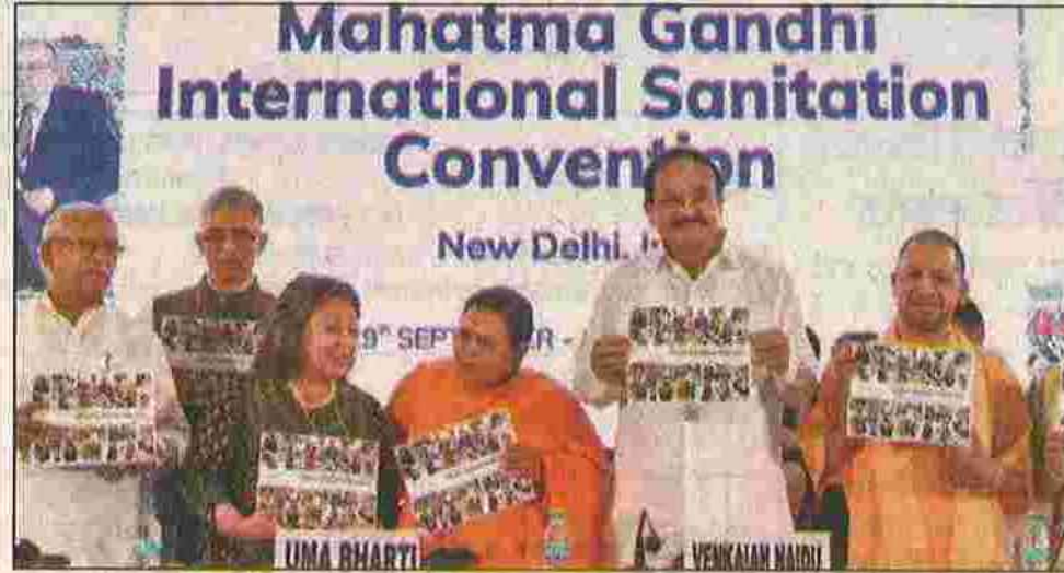
नई दिल्ली में राष्ट्रीय स्वच्छता सम्मेलन के समापन कार्यक्रम में भाग लेते उपराष्ट्रपति एम. वेंकैया नायडू, उत्तर प्रदेश के मुख्यमंत्री योगी आदित्यनाथ, जल संसाधन मंत्री उमाभारती।

नई दिल्ली, (भाषा): उपराष्ट्रपति एम. वेंकैया नायडू ने वैचारिक असहमति के नाम पर आतंकवाद और कट्टरता के सहारे सामाजिक तनाव फैलाने की बढ़ती प्रवृत्ति पर चिंता व्यक्त करते हुए कहा है कि 'विघटनकारी असहमति' किसी भी सभ्य समाज में स्वीकार्य नहीं हो सकती। नायडू ने सोमवार को राष्ट्रीय मानवाधिकार आयोग द्वारा आयोजित अंतरराष्ट्रीय मानवाधिकार सम्मेलन में अपने संबोधन में कहा "असहमति के लोकतांत्रिक अधिकार को ढाल बनाकर आतंकवाद और कट्टरता को बढ़ावा देने वाली ताकतें वैश्व शांति के लिए खतरा बन गई हैं। शांति की पहल करने वाले भारत सहित अन्य देश इस खतरे से जूझ रहे हैं। इसलिए समय आ गया है जब विश्व समुदाय इस मुद्दे पर एकजुट होकर गम्भीरता से सोचे।" नायडू ने कहा कि आयोग की स्थापना की रजत जयंती के अवसर पर आयोजित यह सम्मेलन इस दिशा में विचार मंथन का महत्वपूर्ण माध्यम बन सकता है। उन्होंने सम्मेलन में हिस्सा ले रहे, विभिन्न देशों के कानूनविदों और सामाजिक कार्यकर्ताओं से इस समस्या के समाधान की ठोस कार्ययोजना पर मंथन करने