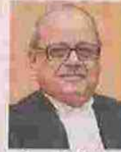
पूर्व जज पीसी घोष