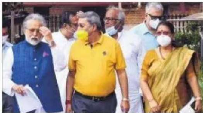
Trinamool Congress delegation members after a meeting with the CEC in New Delhi on Thursday.

Underscoring the need to provide justice to victims and to restore their confidence in the criminal justice system, the report recommended that all heinous cases, including murder, unnatural deaths,