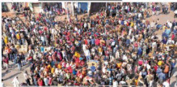
गाजियाबाद के मुरादनगर में शव को सड़क पर रखकर जाम लगाते मृतकों के स्वजन का दृश्य