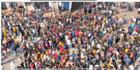
गाजियाबाद के मुरादनगर में शव को सड़क पर रखकर जाम लगाते मृतकों के स्वजन का दृश्य