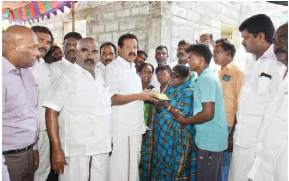
Ministers K. Ponmudy and Gingee K.S. Masthan handing over the solatium to the families of the victims in Villupuram district on Tuesday.

Till Monday, a total of five people had died after consuming spurious liquor in Perunkaranai village, falling under the Siddhamoor police station limits. The victims, including