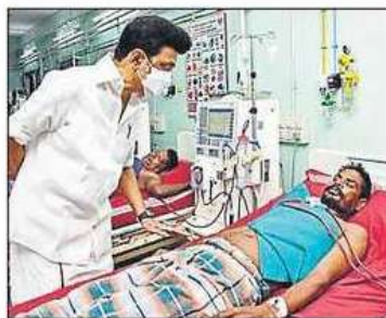
CM Stalin meets a man hospitalised after allegedly consuming spurious liquor

The Commission has observed that the contents of the media reports, if true, amount to a violation of the right to life of the people. Accordingly, it has