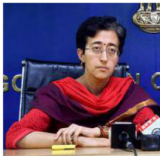
PWD Minister Atishi.