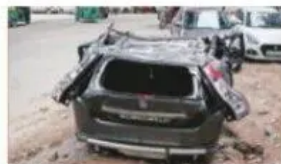
The WagonR car fell off the under-construction Barapullah Phase III flyover on Monday night. Prem Nath Pandey

In its incident report, PWD said the flyover was barricaded with "heavy portable RCC crash barriers". "As noticed by field staff the next morning, one of the installed RCC portable crash barriers was dislocated to make the way for entry towards an incomplete area of the bridge," it stated.