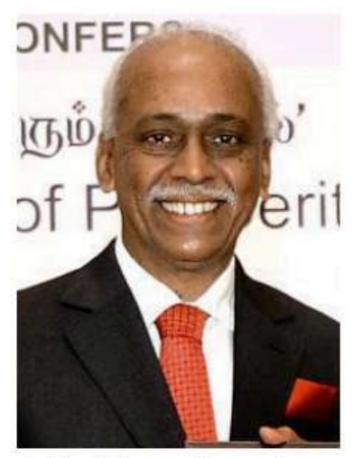
Justice V. Ramasubramanian