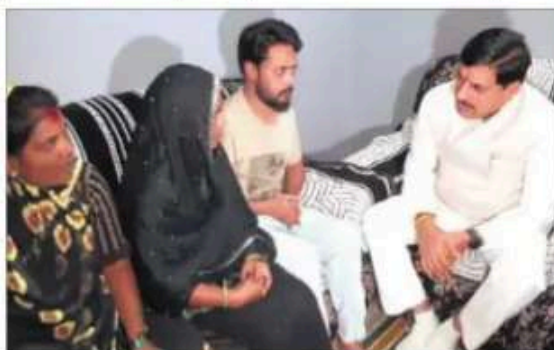
Madhya Pradesh CM Mohan Yadav meets a family of cough syrup tragedy victim in Chhindwara on Monday.

"The authority is also directed to order all the chief drugs