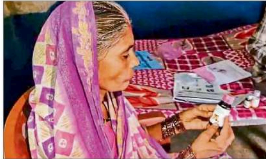
An elderly woman looks at a bottle of Coldrif cough syrup in Betul of Madhya Pradesh.

The commission said it has received a complaint seeking urgent intervention in cases of the deaths of 12 children in Madhya Pradesh (Chhindwara and Vidisha districts) and some