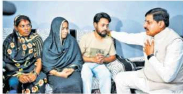
Madhya Pradesh CM Mohan Yadav meets with the kin of the victims on Monday

tion (IMA), strongly condemned it. Demanding immediate action on the actual culprits and adequate compensation for the affected families and the doctor, the IMA said they are concerned with the "incompetence and inadequacy of the drug regulatory system in the country and mishandling of this unfortunate incident."