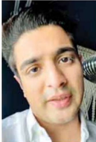
Social media personality Ranveer Allahbadia apologises for his remarks on reality show 'India's Got Latent'