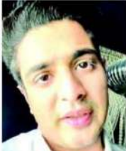
In this screenshot taken from a video posted via X on Monday, social media personality Ranveer Allahbadia apologises for his remarks on reality show India's Got Latent.

NEW DELHI, Feb 10: Influencer Ranveer Allahbadia's distasteful comment on parents and sex led to massive outrage across the spectrum today, prompting the YouTuber with almost 16 million followers on social media platforms to apologise and say comedy is not his forte.