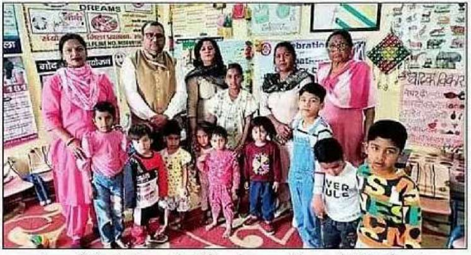
आंगनबाड़ी केंद्र में जांच करने पहुंची राष्ट्रीय मानवाधिकार की विशेष टीम।

अंबाला सिटी। राष्ट्रीय मानवाधिकार आयोग नई दिल्ली से विशेष टीम ने शनिवार को जिले में विभिन्न विभागों में निरीक्षण किया।