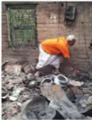
STATESMAN NEWS SERVICE KOLKATA, 15 APRIL

As Murshidabad turned into a flashpoint of unrest following violent protests against the Waqf Act, the National Human Rights Commission (NHRC) has decided to send a team to investigate alleged human rights violations in the district, according to sources.