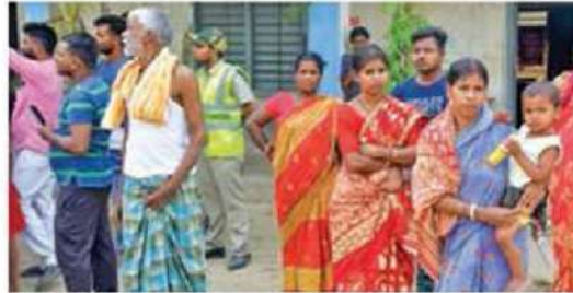
Violence-affected people from Murshidabad take shelter at a school in West Bengal's Malda district on Tuesday.

The Centre's move comes as reports indicated