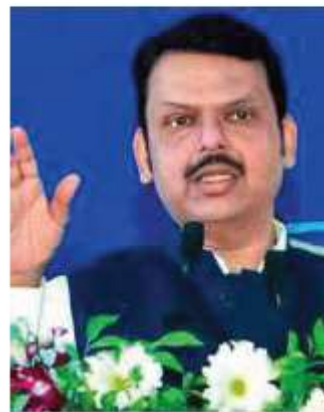
Maharashtra Chief Minister Devendra Fadnavis

Under the new policy, a compensation of ₹5 lakh will be granted to the legal heirs of prisoners who die due to accidents during prison work, negligence by medical staff, assaults by prison officials, or violence involving fellow inmates – if a subsequent inquiry confirms administrative negligence. In cases of sui-