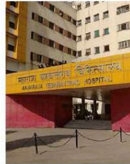
The hospital in whose neonatal ward the two newborns were gnawed by rats. FILE PHOTO

Even as the doctors continue to insist that the rat bites did not cause the deaths and that the newborns were already critical due to multiple congenital anomalies, the family of