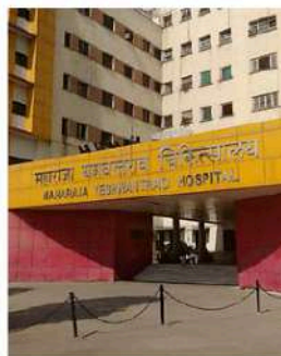
The hospital in whose neonatal ward the two newborns were gnawed by rats. FILE PHOTO

Even as the doctors continue to insist that the rat bites did not cause the deaths and that the newborns were already critical due to multiple congenital anomalies, the family of