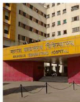
The hospital in whose neonatal ward the two newborns were gnawed by rats. FILE PHOTO

Even as the doctors continue to insist that the rat bites did not cause the deaths and that the newborns were already critical due to multiple congenital anomalies, the family of