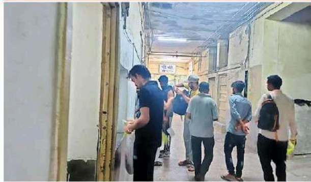
पुरानी जर्जर इमारत में चल रही फार्मसी के बाहर खड़े मरीज व स्वजन

• अधिकारियों ने एनएचआरसी के नोटिस देने पर जताई अनभिज्ञता