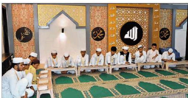
NHRC had directed a criminal and financial probe with focus on alleged illegal recruitment and fraudulent use of madrassa land grants

Writ petitions were filed in HC by associations of madrassa managers and teachers, seeking quashing of the NHRC directives, issued this year on Feb 28, April 23 and