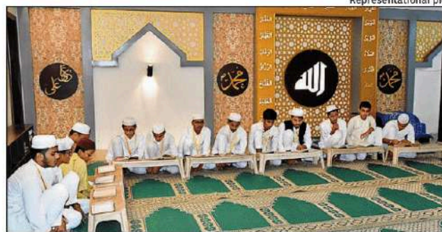
NHRC had ordered a criminal & financial probe into govt-aided madrassas