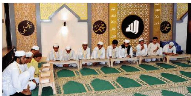
NHRC had directed a criminal and financial probe with focus on alleged illegal recruitments and fraudulent use of madrasa land grants

Writ petitions were filed in HC by associations of madrasa managers and teachers, seeking quashing of the NHRC directives, issued this year on Feb 28, April 23 and June 11, and the consequent