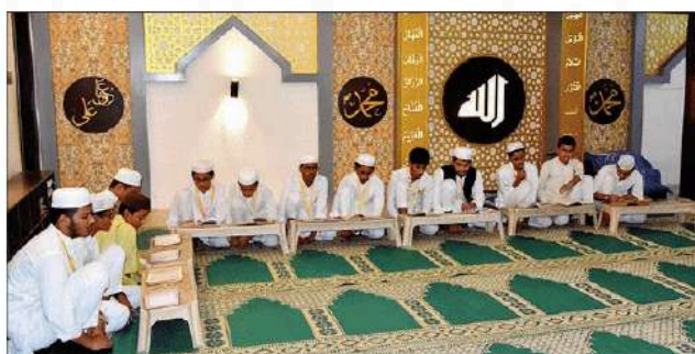
NHRC had directed a criminal and financial probe with focus on alleged illegal recruitments and fraudulent use of madrassa land grants

Writ petitions were filed in HC by associations of madrassa managers and teachers, seeking quashing of the NHRC directives, issued this year on Feb 28, April 23 and June 11, and the consequent