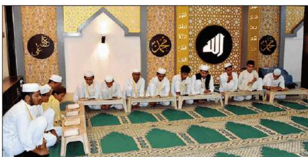
NHRC had directed a criminal and financial probe with focus on alleged illegal recruitments and fraudulent use of madrassa land grants

Writ petitions were filed in HC by associations of madrassa managers and teachers, seeking quashing of the NHRC directives, issued this year on Feb 28, April 23 and June 11, and the consequent