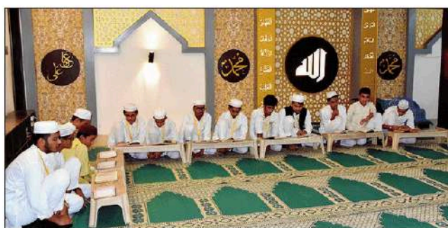
NHRC had directed a criminal and financial probe with focus on alleged illegal recruitments and fraudulent use of madrassa land grants

Writ petitions were filed in HC by associations of madrassa managers and teachers, seeking quashing of the NHRC directives, issued this year on Feb 28, April 23 and June 11, and the consequent