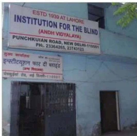
The Institution for the Blind - Andh Vidyalaya in New Delhi

"In accordance with the provisions of Section 19 of the RTE Act, 2009, and Sec-