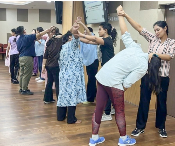
► NHRC, India women employees undergoing self-defense training

The Newsletter is also available on the Commission's website www.nhrc.nic.in . NGOs and other organisations are welcome to reproduce material of the Newsletter and disseminate it widely acknowledging the NHRC.