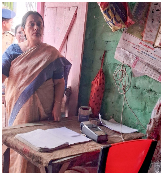
▶ NHRC, India Special Rapporteur, Smt Suchitra Sinha inspecting a PDS Centre in Jharkhand