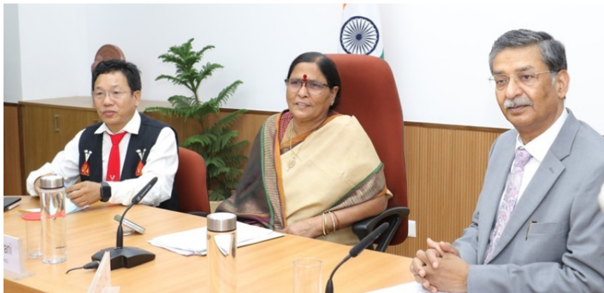
► NHRC, India Acting Chairperson, Smt Vijaya Bharathi Sayani addressing the valedictory session of the capacity building programme for APSHRC

The Commission also organised a three-day capacity building programme for the Arunachal Pradesh State Human Rights Commission (APSHRC) at its premises in New Delhi from 18 th -20 th November, 2024. It was part of the ongoing initiative of the Commission to reach out and help in the capacity building of the State Human Rights Commissions (SHRCs) for protecting and promoting the human rights of all in the country. A total of twelve officers of the APSHRC including its Acting Chairperson, Shri Bamang Tago and Secretary, Shri Ibom Tao were in attendance.