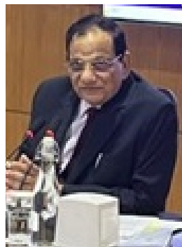
Dr. V. K. Paul Member, NITI Aayog