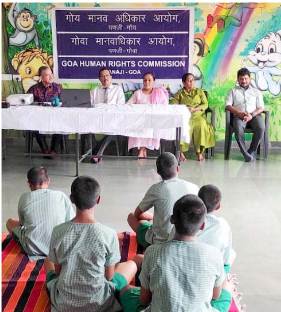
▶ GSHRC officers at Apna Ghar Protective Home-Cum-Reception Centre in Merces, Goa

The Goa State Human Rights Commission (GSHRC) was established on 4 th March, 2011. Led by the Acting Chairperson, Shri Desmond D'Costa, GSHRC officers visited the Apna Ghar Protective Home-Cum-Reception Centre in Merces, Goa on 14 th November, 2024 to raise awareness about human rights among the inmates. They interacted with 14 male children and 12 female inmates and conducted a session on various aspects of human rights. The facility was found to be well-maintained, clean, and decorated with child-friendly paintings. The GSHRC also assessed the human rights situation and overall conditions at the Protective Home-Cum-Reception Centre.