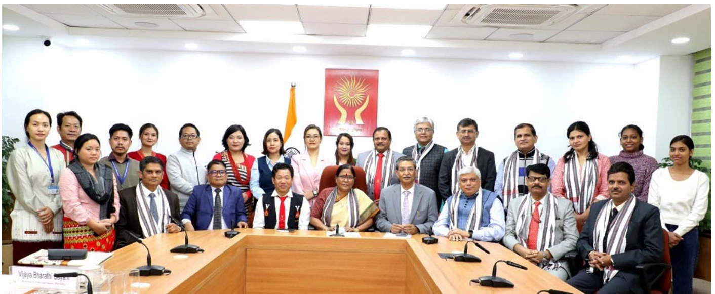
► NHRC, India and APSHRC officers

He said that the officers would further deliberate on the various aspects of the practical learning to implement these in the functioning of APSHRC and discuss the same with the State Government to build awareness about human rights among the people in the State and address their concerns through collective efforts.