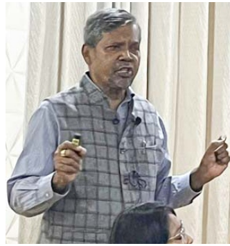
Shri Akshay Rout former DG, Election Commission of India