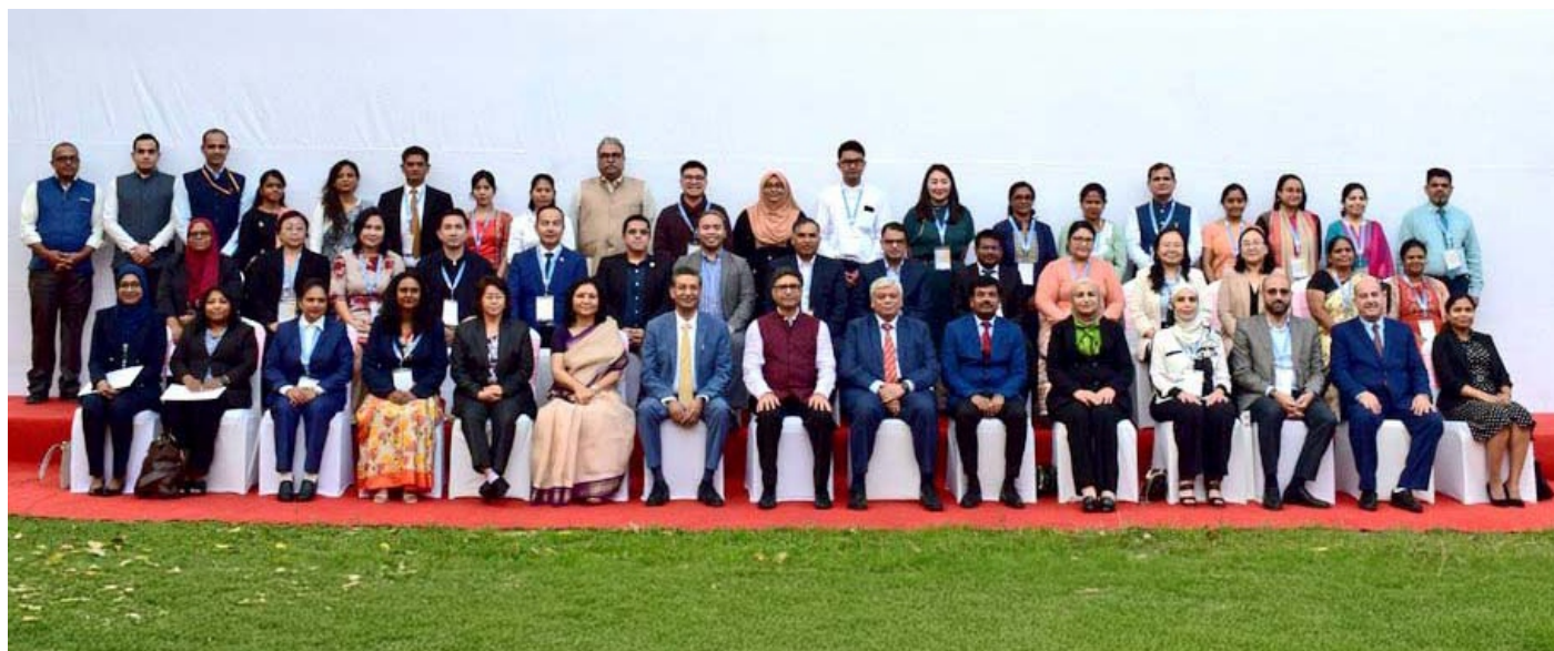
► NHRC, India and MEA senior officers with the participants of eight NHRIs of Global South

The participants were also treated to a cultural immersion tour of the Taj Mahal, Agra, on the concluding day. This visit underscored the importance of heritage in human rights discourse, celebrating India's rich legacy of diversity and mutual respect.