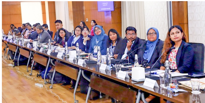
▶ A section of participants