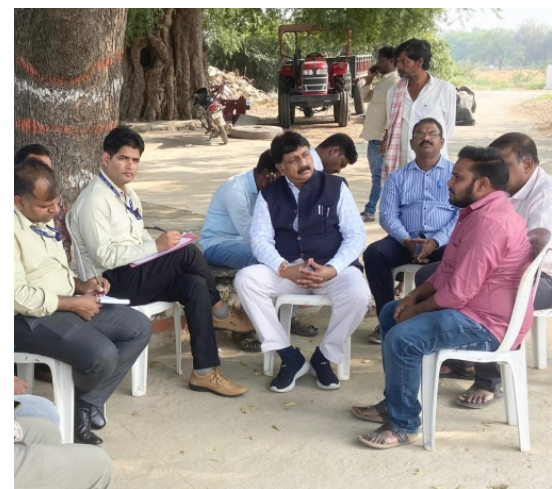
► NHRC, India officers conducting a spot enquiry into allegations of false implication of the villagers protesting against the land acquisition in Lagacharla, Telangana