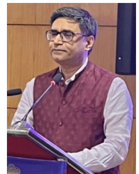
Shri Vikram Misri Foreign Secretary of India