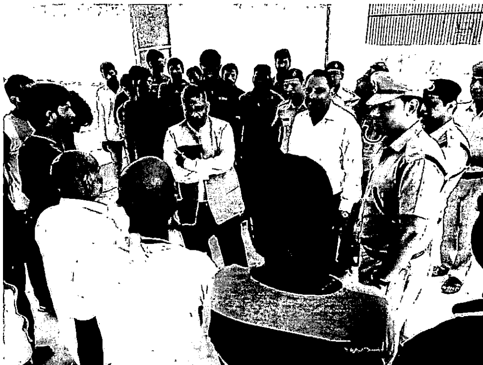
Visit to Barracks and Interaction with Prisoners